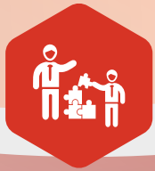
Soft Skills Training