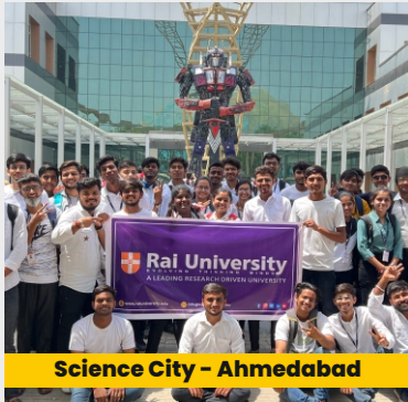
Science City - Ahmedabad