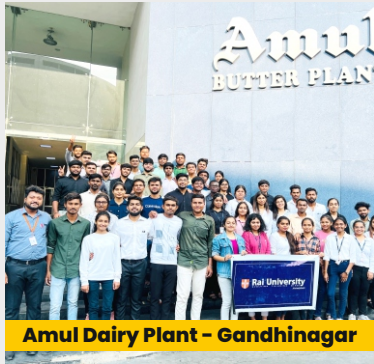
Amul Dairy Plant - Gandhinagar