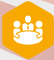
Career Orientation Programs