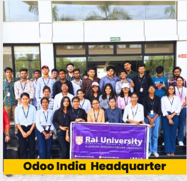
Odoo India Headquarter